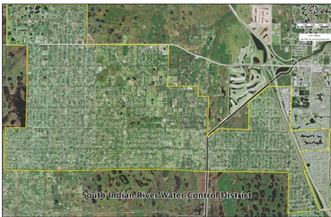
South Indian River Water Control District encompasses over 12,500 acres and is responsible for maintenance of canals, swales and roadways

With approximately 90% of the District developed, operation and maintenance activities are the main focus. The District continues activities involving site specific drainage improvements that impact landowners, canal and culvert maintenance, and replacement or renewal of facilities that affect the works of the District. The District also continues to operate and maintain roadways and a park, as well as plan new capital and landowner initiated improvements. The staff investigates whether improvements should be made to other existing infrastructure, such as canals, bridges, or drainage structures, and throughout the year, landowner initiated roadway improvement petitions for the application of Palm Beach County Standard Asphalt were received and reviewed by District staff.