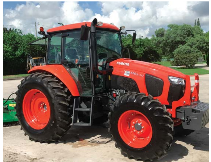
South Indian River Water Control District has added a new Kubota M6S Tractor to their fleet of vehicles

Our Driveway Culvert Replacement Program has been very productive. To date, we have installed 207 culverts and have 59 on schedule. This program allows the District to replace culverts at a cost of $300.00 for a standard install.