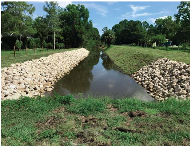
Canal 3 rip rap stabilization

From October 2016 to August 2017, 51.57 inches of rain was recorded at the District Work Center. Here is a breakdown of the monthly totals and the ten year average: