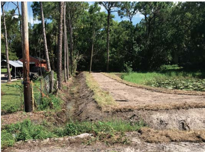
154th Street reclaimed outfall swale

Culverts under driveways have been aging over the years. These culverts are the landowner’s responsibility to maintain and to replace them when their life span has ended. These culverts, when not maintained, are collapsing and blocking the secondary drainage system of the District. The District has instituted a culvert replacement program which allows the landowners to pay the District for the replacement of their culverts. This year, the District installed 207 culverts.